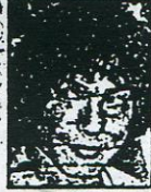
Jason Scott Lee: Chin Ho Kelly