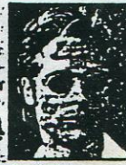
Brad Pitt: "Dano" Williams 1984